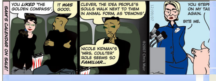
Commentary, News Analysis and Opinion without a hidden agenda

The only authorized Tooth Fairy Collection!