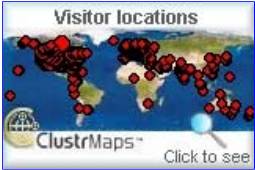
NOTE: Visits is a number to be validated