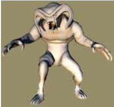
One of them recently spotted: shields down.