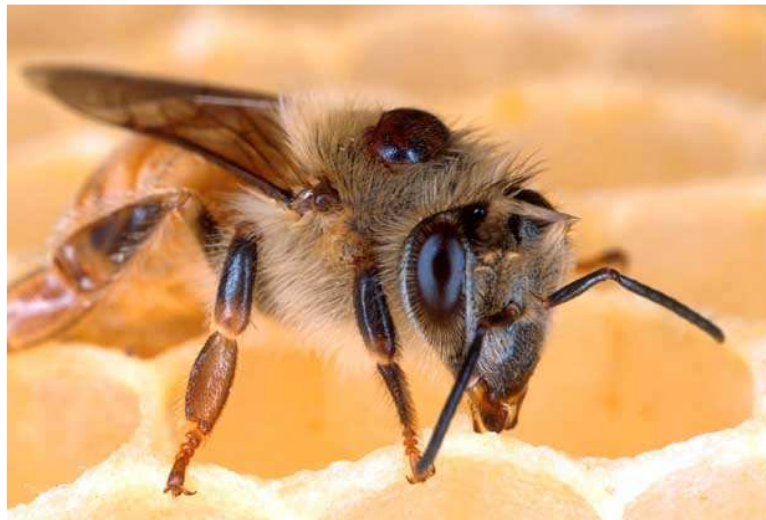
Deadly, parasitic Varroa mite attaches itself to honeybee's thorax where wings meet.

In 2007, scientists found a strong association between CCD and a virus transmitted by parasites.