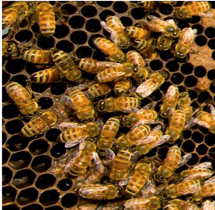
Healthy honeybees on honeycomb

Likewise, Coumaphos, used to treat Varroa mites in honeybees, was also found in higher levels in healthy colonies. However, pesticides have not been ruled out as a cause of CCD.