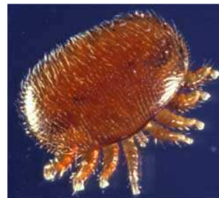
Close-up photo of Varroa mite

IAPV was also reportedly found in package bees imported from Australia and royal jelly imported from China, the USDA's Bee Research Laboratory stated in a report titled, " Historical Presence of Israeli Acute Paralysis Virus in the United States ." According to those researchers, the results from their survey indicate "IAPV has been circulating in U.S. bee populations since at least 2002" and the virus predates the latest incarnation of CCD.