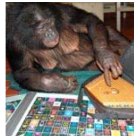
Bonobo participates in musical performances with musicians

Members of Parliament in Spain are being asked to support legislation endorsed by the international organization Great Ape Project , which advocates a United Nations Declaration of the Rights of Great Apes that would confer basic legal rights on great apes. The law would be based on the assertion apes deserve a right to life, freedom and protection from torture.