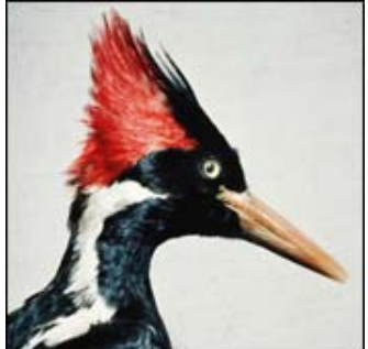
The "Lord God Bird"