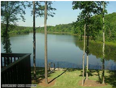
A view of the East Point Reservoir in Lithia Springs, Georgia, in 2006 ...

ATLANTA, Georgia (CNN) -- The state of Georgia, stricken by months of drought, confirmed Friday that it will sue the Army Corps of Engineers.