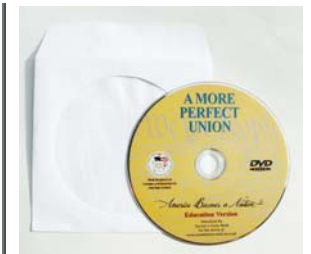
The story of our Constitution

It's a soda without any fizz, A none-of-the-above kind of quiz, And the voters agree With the late Peggy Lee, Who demanded, "Is that all there is?"