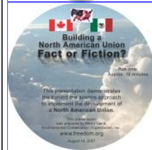
North American Union DVDs Now Available