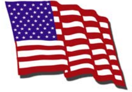
Magnetic Window Decal (5 x 4 inches)